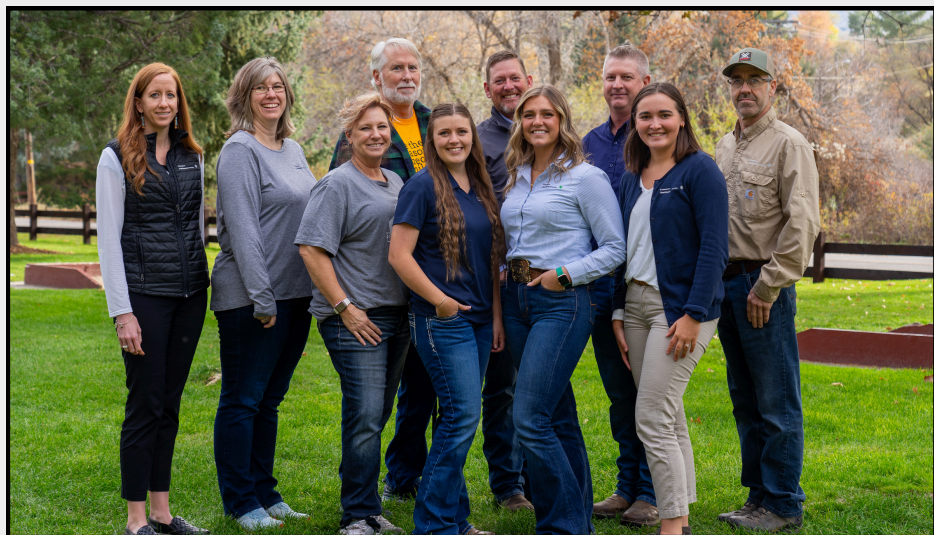
USU Extension Staff in Cache County

Utah State University Extension has been serving the community of Utah since 1914. USU Extension provides research-based information and programs in a variety of fields, such as gardening, youth programs, relationships, finance, health, nutrition, and agriculture. In Cache County, there's always something going on, but the summer time is when USU Extension really shines.